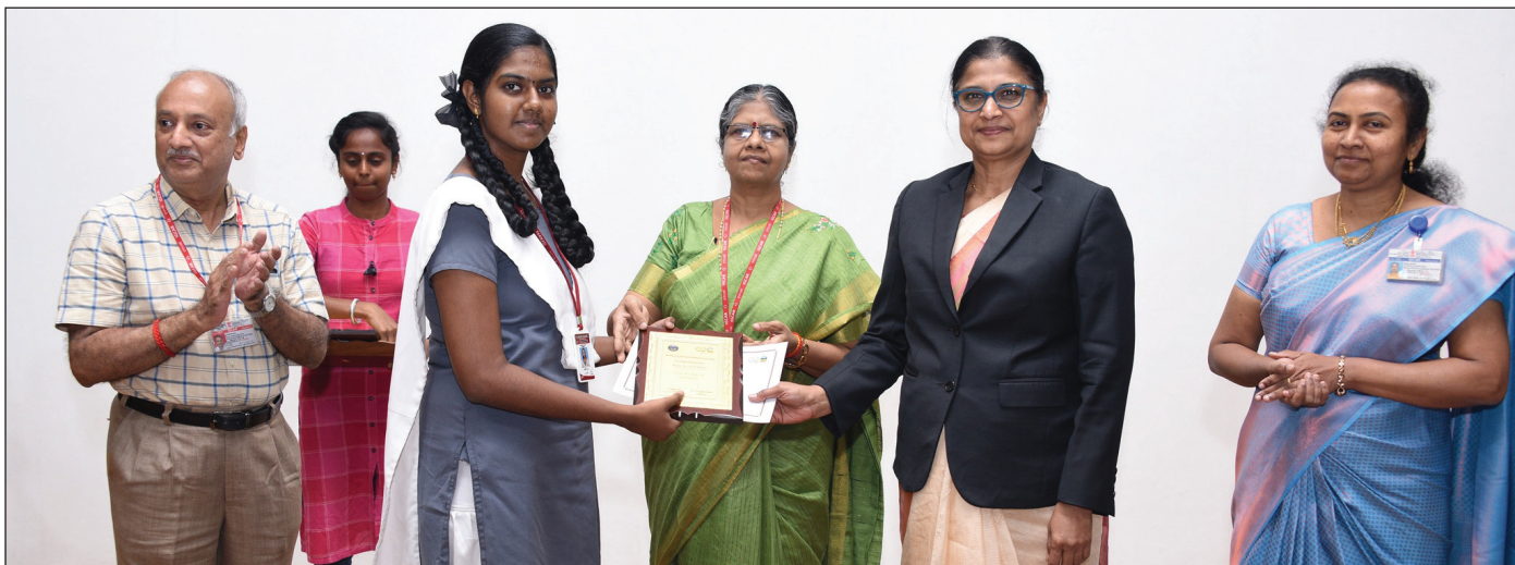
Felicitation to school children

Women's Day was celebrated from March 1- 7, 2023, at IGCAR. The celebrations included competitions and felicitating girl students who have excelled in studies, sports and cultural events. Distinguished women in law and justice, news broadcasting and financial advice were invited to share their experiences and educate the audience.