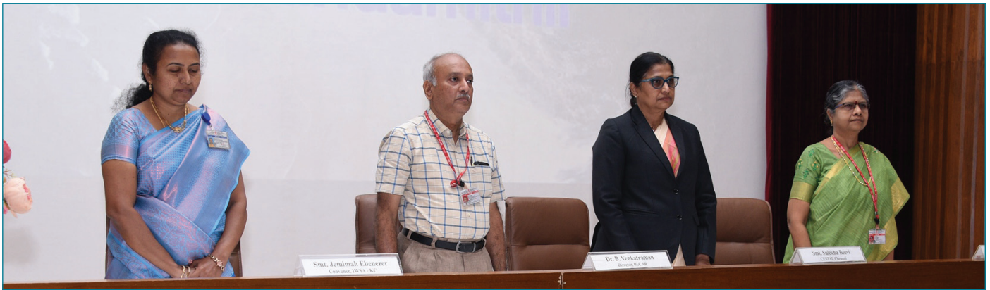
International Women's day celebrations

and the various schemes for women's empowerment. More than 150 employees participated in the competitions. Forty employees played six skits on topics including Women's empowerment, Gender Equality, the Role of working women in society, The benefit of treating women with dignity, Innovative methods to protect women and Government schemes for women. The best slogan is portrayed on the Figure-1.